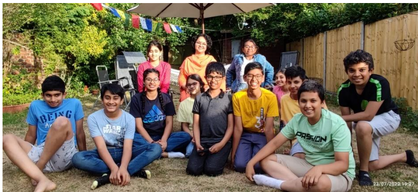
With children at Reading after discussion on Good for all - Dharma

Subscribe | aarshavidyabharati@gmail.com | Aarsha Vidya Foundation | Arsha Vidya Ananda | SHINE