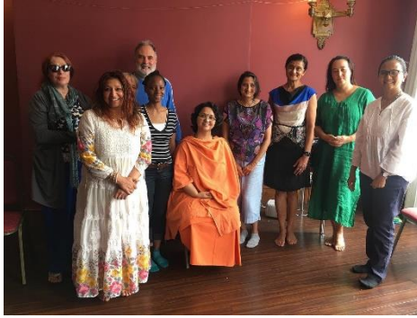
Learning to deal with anything - With participants at Greenwich