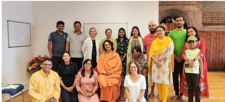
After session on the Wisdom of the Bhagavad Gita, at Reading Hindu temple